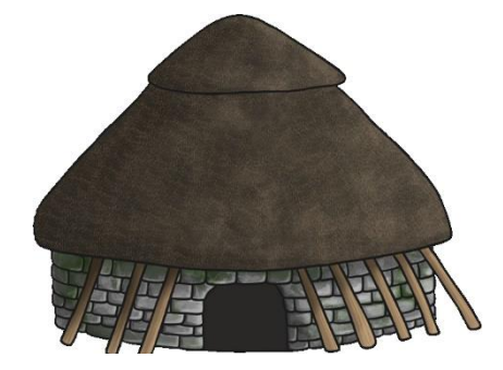
Neolithic - new