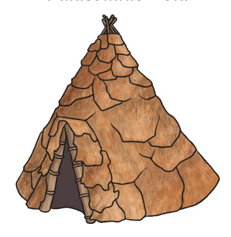
Mesolithic - middle