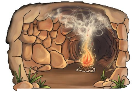
Palaeolithic - old