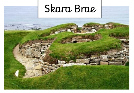
A stone-built settlement.