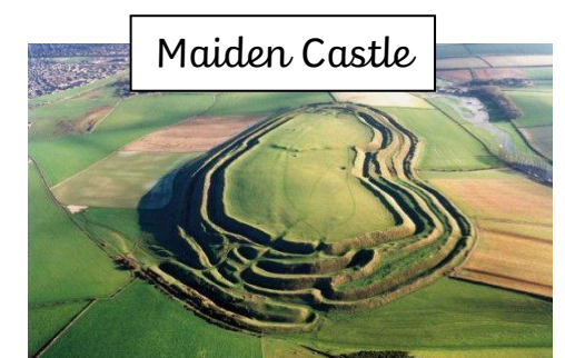
An Iron Age hillfort.