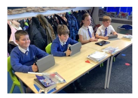
Year 4 completing research through their tablets