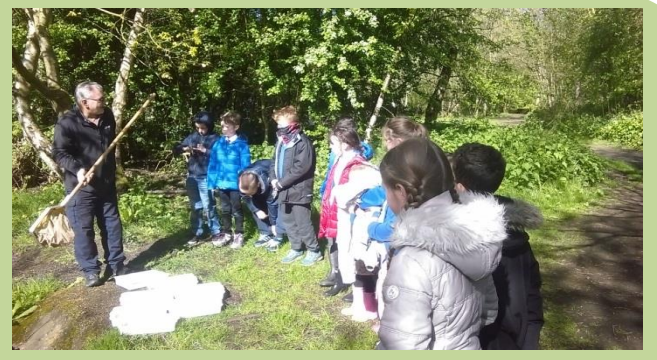
(A photograph of the Year fours pond dipping)

Year 6 Lakes Residential- 19<sup>th</sup> June- 23<sup>rd</sup> June 2017